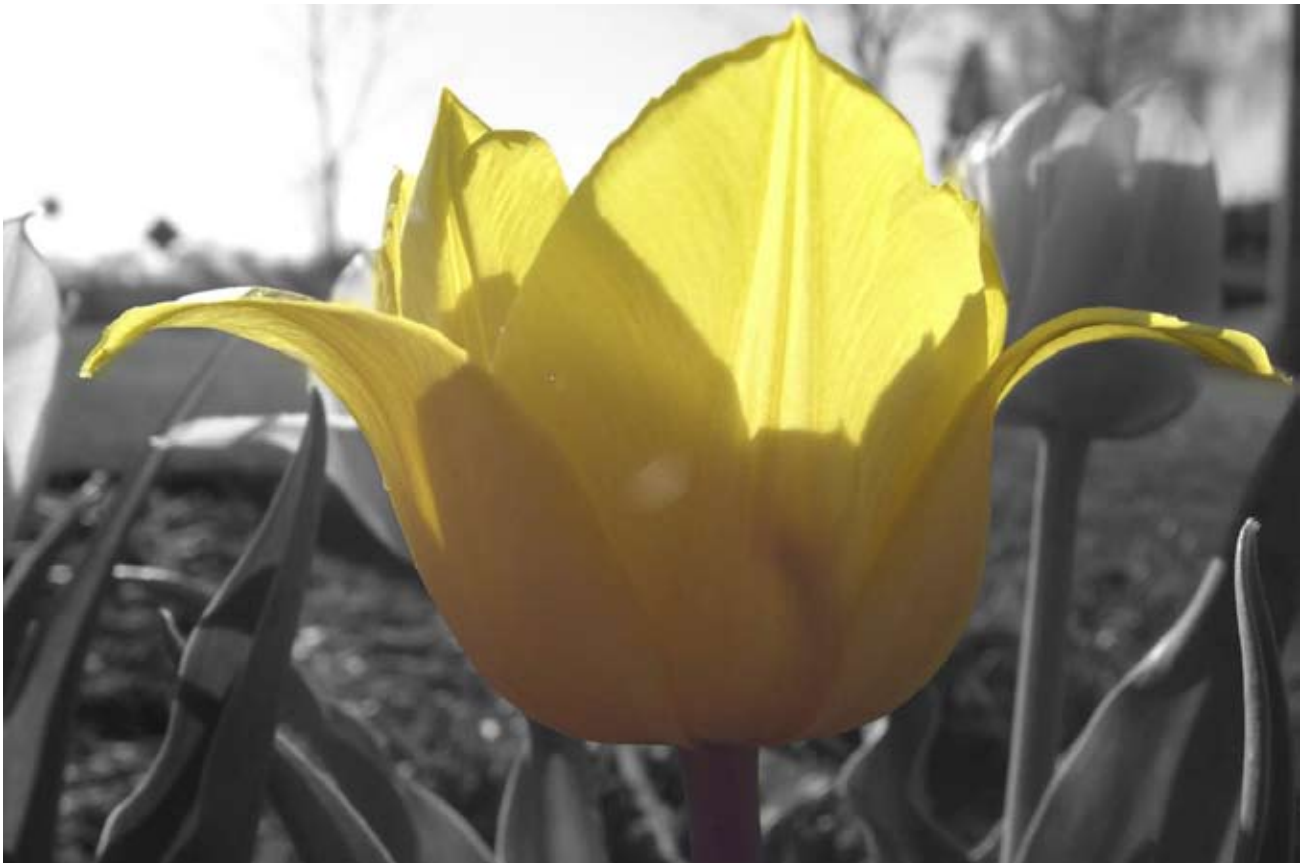
Yellow Tulip by Sofie Landry - IMG #3 - www.sofie.graf-ix.org

Deadline for Submissions to IMG #7 - June 16